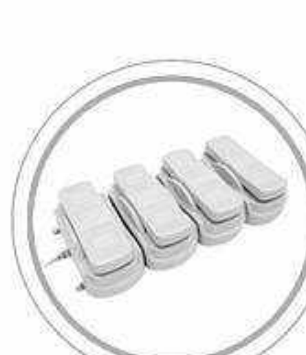
Food Control Panel

And please contact for many more accessories.